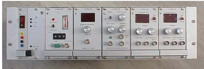
Control system for laser diode: current and temperature control - high tension amplifier unit - synchronous digital detection unit. Application in the control and frequency control of one laser diode.